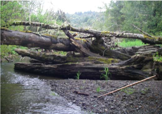
Unit 10 - Upstream view of habitat structure debris jam.