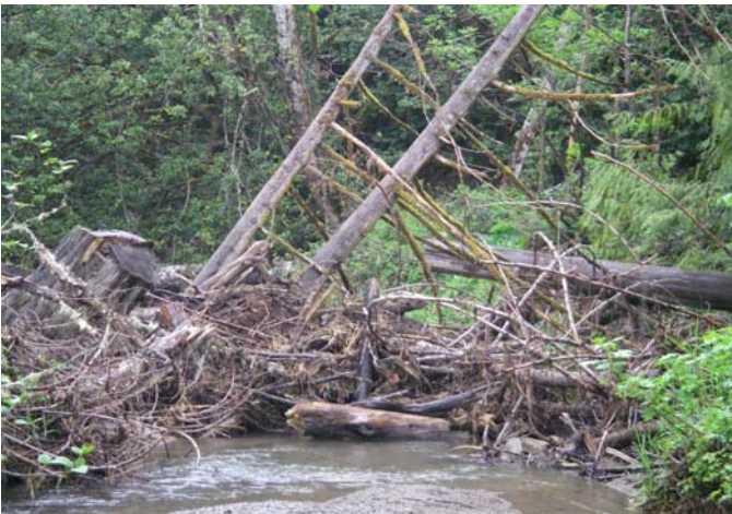
Unit 40 - Habitat structure collecting debris.