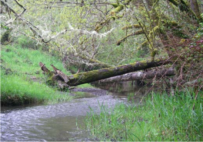
Unit 4 - Upstream view of habitat structure near start of survey.