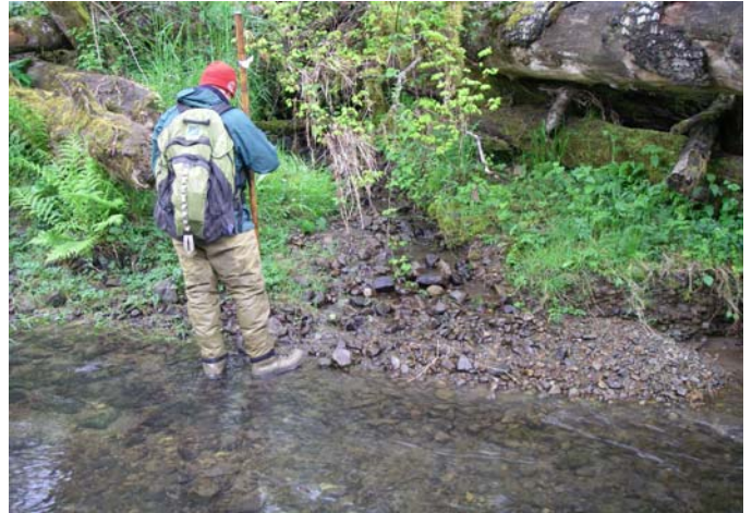
Unit 11 - Small tributary with placed logs visible.