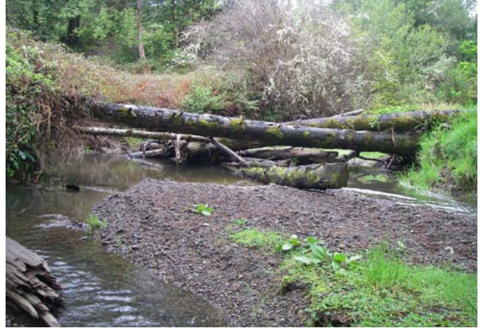
Unit 7 - Looking upstream towards placed log habitat structures.