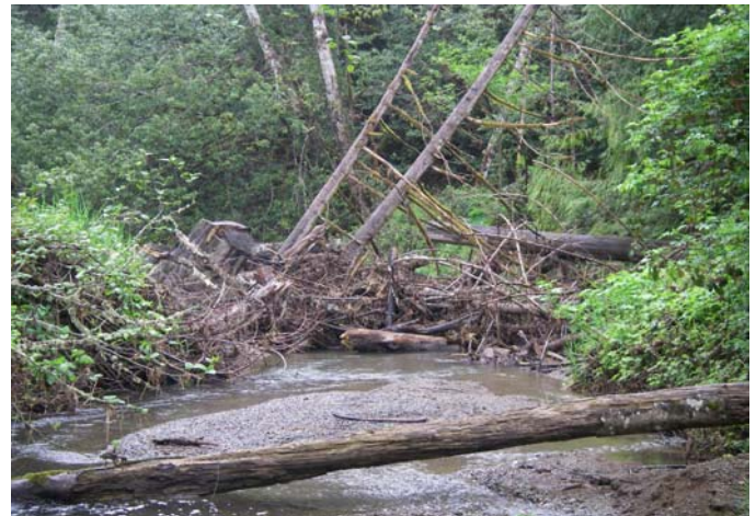
Unit 40 - Debris jam collecting wood and accumulation of gravel.